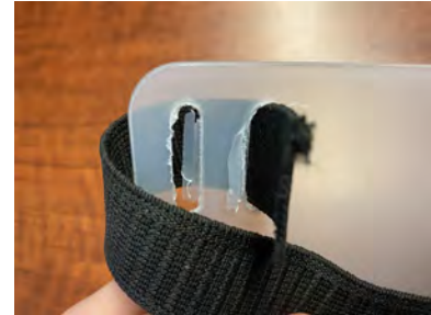
Elastic (black or white)