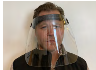
Finished Face Shield